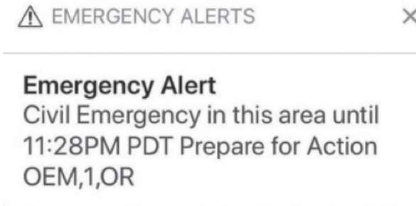
Figure 1. The first emergency alert on May 29, 2018, communicated this message, after City of Salem officials overlooked unchecking the default message option, which overrode the specific water advisory description.