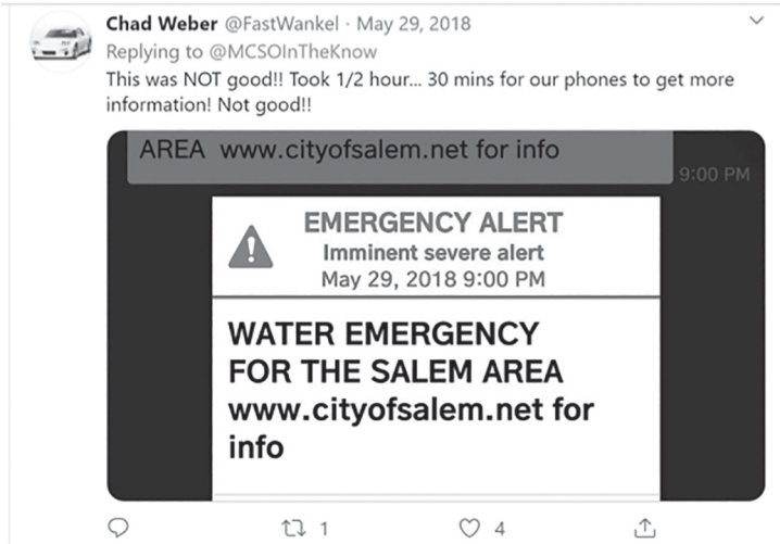
Figure 3. An updated message reached recipients half an hour after the initial alert.